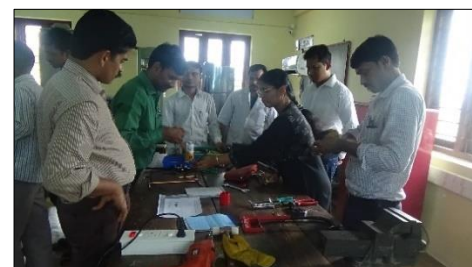
Training of Trainers' Workshop