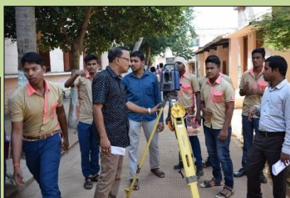
Total Station Survey