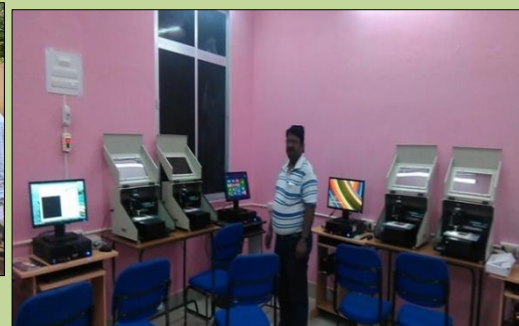
Value Addition Lab PCB Designing