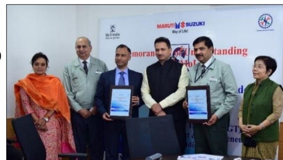
MoU signing between DGT representatives and Maruti Suzuki Representatives

As a part of the agreement, Maruti Suzuki in consultation with DGT will develop specific training modules as per need of the automobile industry. The company shall conduct courses at pan-India locations leveraging the facilities and services available at ITIs, regional training centers, training centers of training partners, vendors and dealers associated with Maruti Suzuki. The courses include Manufacturing, Automotive Service & Repair, Automotive Body Repair and Automotive Paint Repair.