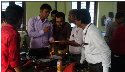
Training of Trainers' Workshop

The theory sessions were followed by practical sessions. Every participant had an opportunity for hands-on practice of copper tube operations including brazing. Workshop demonstration was done for "quality installation" of split and window ACs, "quality repairs/service process" and use of vacuum pumps.