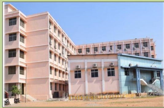
ITI Berhampur Building