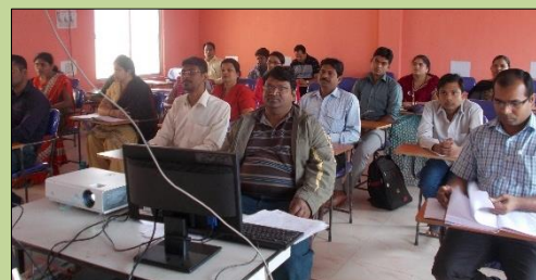
Distance Learning Classroom