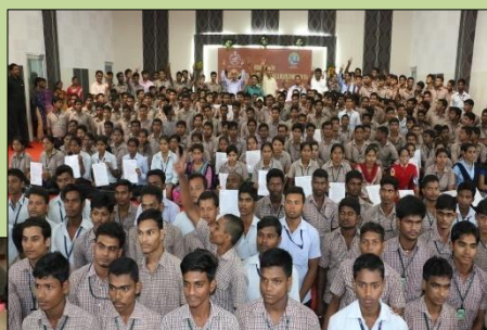
Distribution of Offer Letters