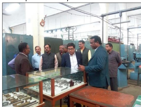
DGT & RIPO Representatives at ATI & CSTARI, Kolkata