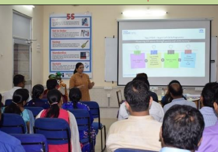
Tata Strive-Bagchi Soft Skill Development Programme