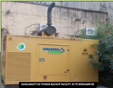
Power Back Up Facility